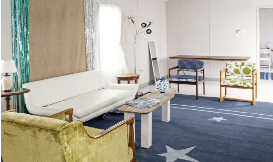
Artists Lounge: Forecastle Music VIP