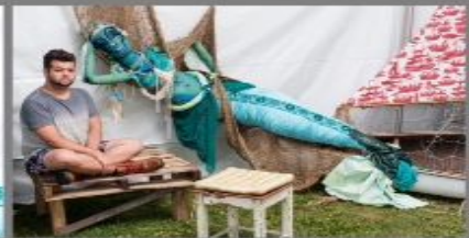
Forecastle Music Festival : Backstage Production Designer Art Student Projects in Artists Lounge