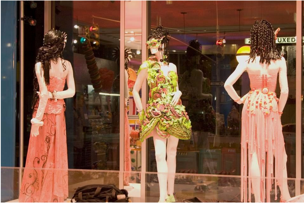
Candy Dresses in Window Display for NYC Fashion Week !!